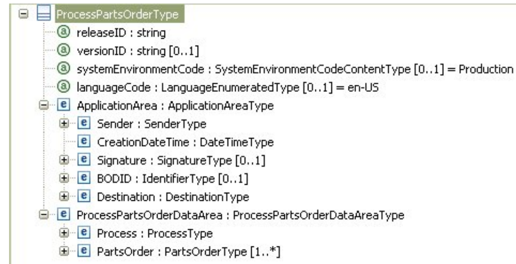
Figure 2.2. Message Hierarchy

The Application Area is standard across the BODs. Every BOD may have a different set of verbs that can be used with it. The verbs describes the various actions that can occur. More detail about these components can be found in the appropriate sections with in this guideline. For a more detailed explanation of the BODs design structure, please refer to the BOD XML Implementation Reference document available from the STAR Web Site.